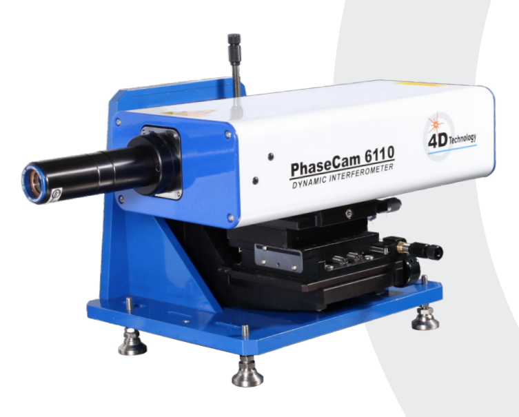
PhaseCam 6110 NIR, with a diverger optic, on the 5-axis pedestal.

Compact and lightweight, the PhaseCam NIR was designed with performance and remote measurement in mind. Moving the system to reconfigure a test set is simple and easy, and isolation equipment is not required. Fully motorized controls make it easy to operate the system in remote locations.